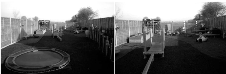
The outside play area, in ground trampoline, builders yard, garden area and low level activity trail.