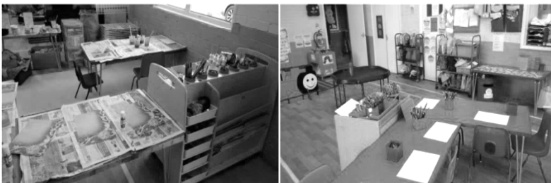
A variety of arts and craft related activities set up for the children.

The team are enthusiastic about the preschool and are dedicated to the children and their learning, aiming to give them the best start on their educational journey. The staff plan a wide variety of activities based around the children's individual learning goals. The staff work closely with parents to ensure that children's needs are catered for and that the transition to school is a smooth one.