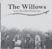
The Willows www.thewillowsband.com