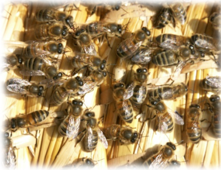
Bees on Skep Hive, Dunton.